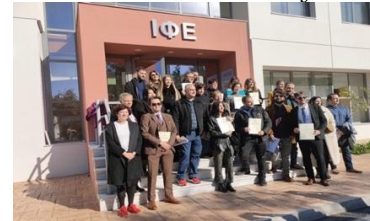
Group photograph in front of the New Building of the Department of History and Philosophy of Science