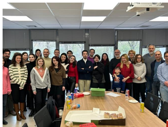
Vasilopita Cutting Ceremony

• The Annual Vasilopita Cutting Ceremony took place at the Laboratory on 12 February 2025 .