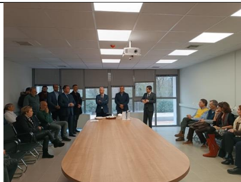
Vasilopita Cutting Ceremony, PHS