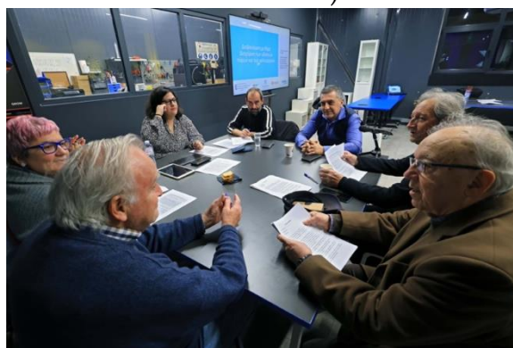
Participants in one of the Labs

The project is implemented within the framework of the National Recovery and Resilience Plan "Greece 2.0", funded by the European Union - NextGeneration EU (Implementing Body: Hellenic Foundation for Research and Innovation - ELIDEK).