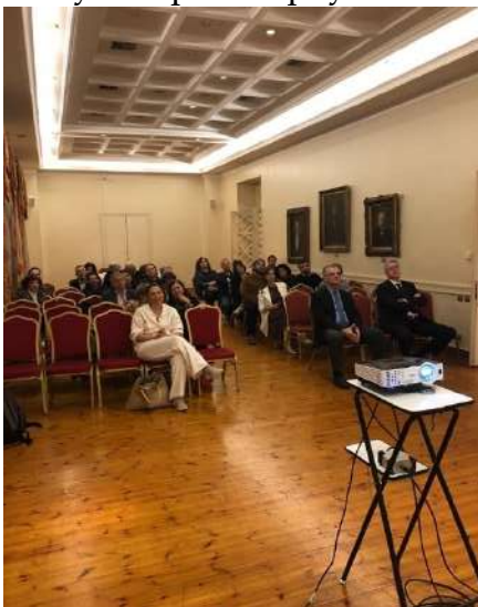
Participants First “Research Celebration Day”