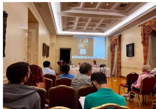
Participants “Cultures of Therapy in Ancient Greece and China”, “Kostis Palamas” Building